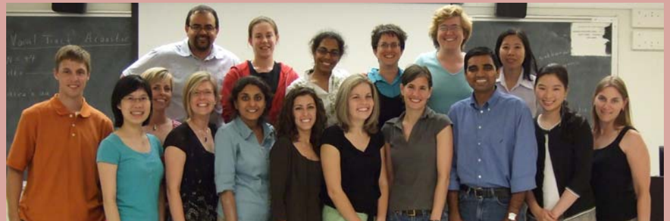
A snapshot during a break in the Genetics course

In addition to the academic benefits of providing an intensive academic experience within a single location, the Institute was created to also increase collaboration among peers, an opportunity not often available to students in small academic programs. (continued on page 2)