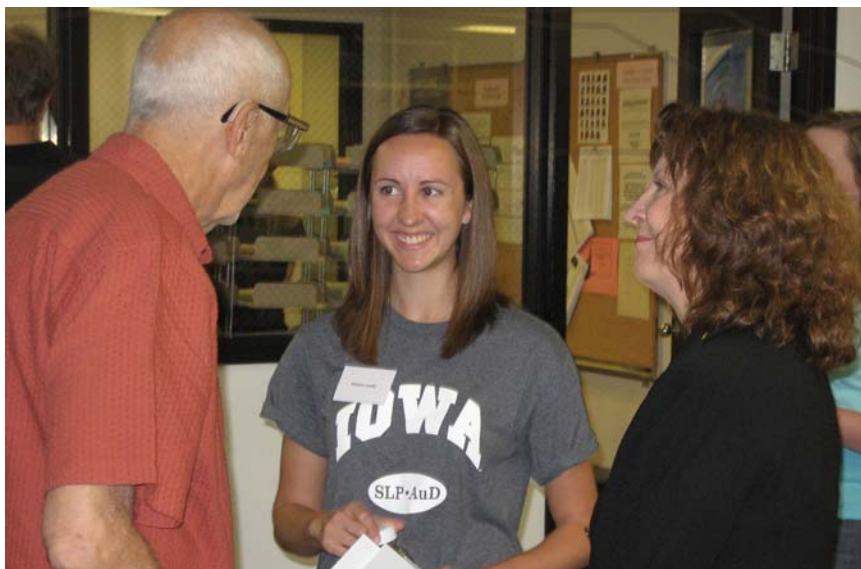
a nice little moment from the reunion...more on page 7