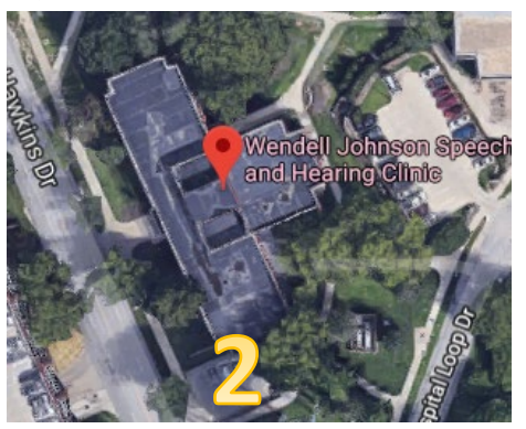
Option 2: Park at the Wendell Johnson Loading Dock

Take the ramp up and around the Loading Dock.